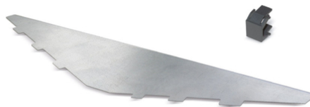
Top cover for patch panel KS 24x-a, angled Blank cover, black